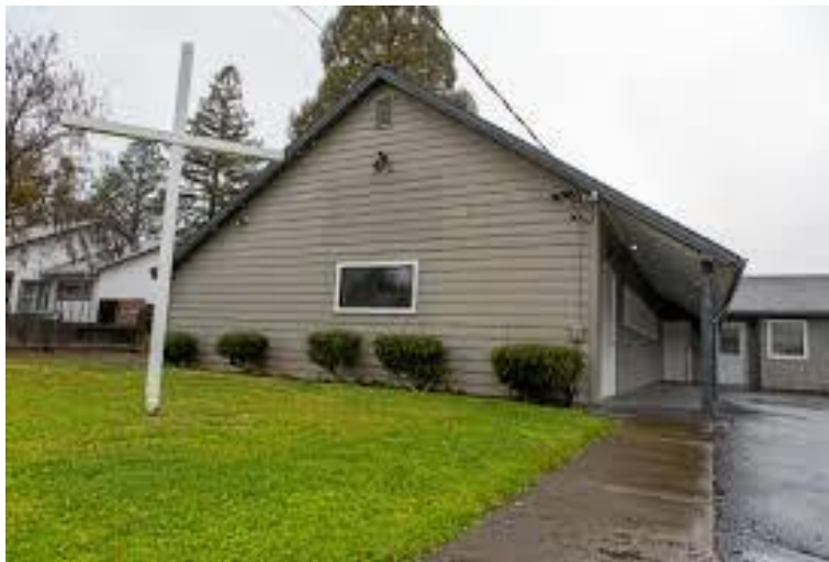
Center for Hope; 150 Luce Ave; Ukiah