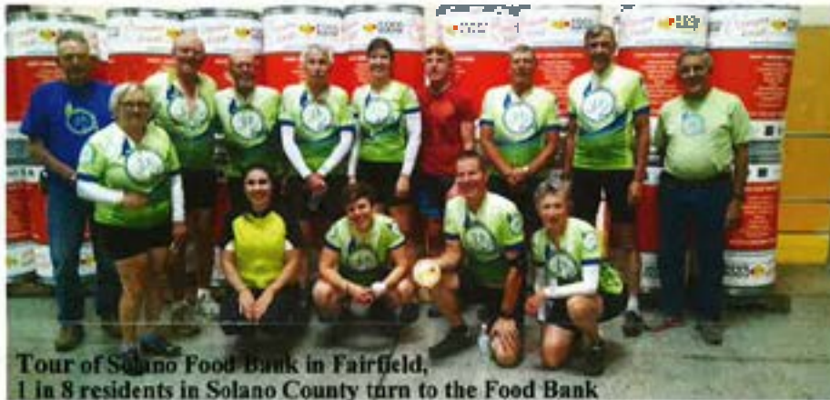
Tour of Solano Food Bank in Fairfield, 1 in 8 residents in Solano County turn to the Food Bank