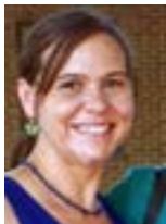
Dory Haselswerdt Children & Youth