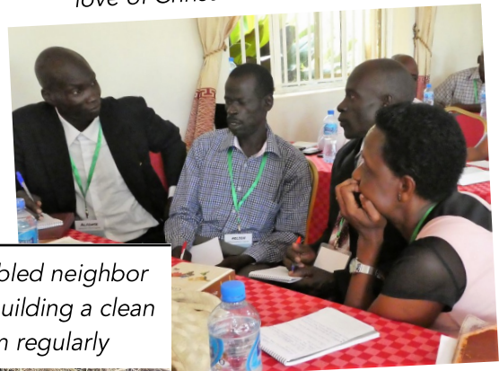
Loving this blind and disabled neighbor means repairing his roof, building a clean latrine, and visiting him regularly