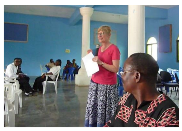
Leading small groups through the morning review

For several months I have been learning from ReachGlobal's Africa Division as we planned a Vision Conference for the leadership of the Evangelical Free Church of West Africa (EFCWA). This denomination is a fresh expression of spirit-filled servant leadership and multiplying church planting in the countries of Guinea, Liberia, Ivory Coast and Sierra Leone. EFCWA wanted their churches to be more transformational in their communities, but needed help to understand how that could happen.