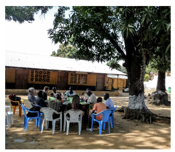
Meeting with church leaders under a mango tree